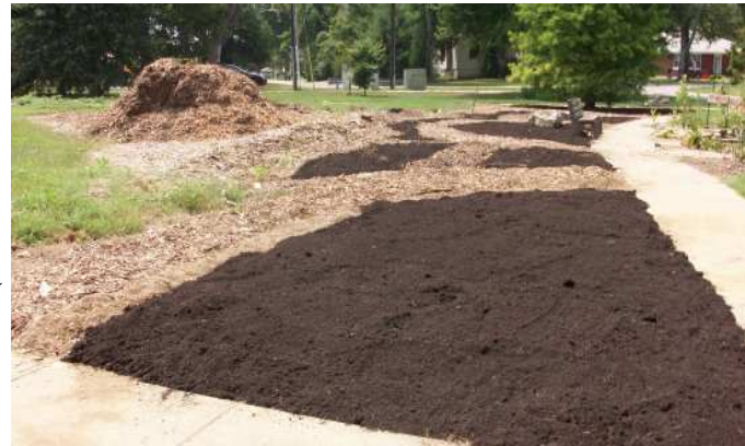
Pictured below: The Sensory Garden takes shape!