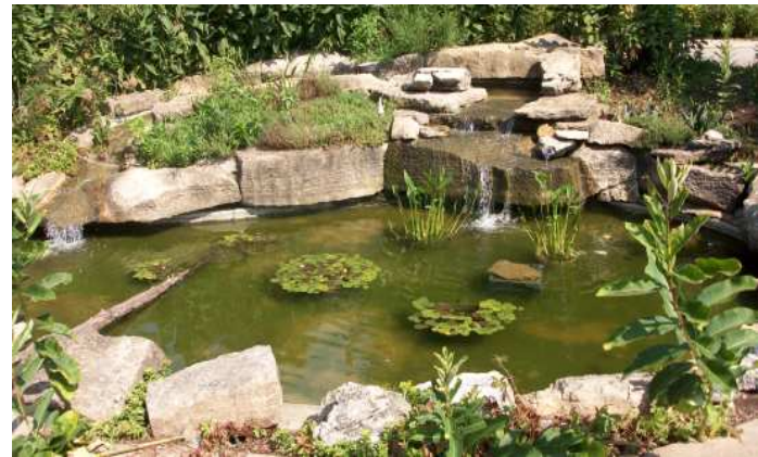
Pictured above: Sensory Garden Pond